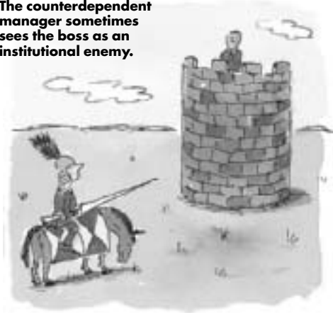
The counterdependent manager sometimes sees the boss as an institutional enemy.

ing constrained are usually strong and sometimes impulsive. He or she sees the boss as someone who, by virtue of the role, is a hindrance to progress, an obstacle to be circumvented or at best tolerated.