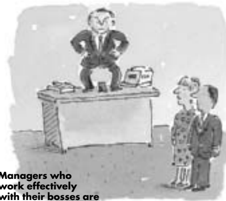
Managers who work effectively with their bosses are sensitive to the boss's work style.

For example, in one case we observed, a manager and his superior ran into problems whenever they disagreed. The boss's typical response was to harden his position and overstate it. The manager's reaction was then to raise the ante and intensify the forcefulness of his argument. In doing this, he channeled his anger into sharpening his attacks on the logical fallacies he saw in his boss's assumptions. His boss in turn would become even more adamant about holding his original position. Predictably, this escalating cycle resulted in the subordinate